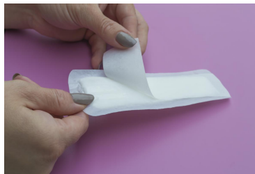
Personal Care Products